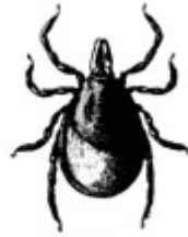
Blacklegged (Deer) Tick

a poppy seed, is the most important stage for transmitting the disease organism. Most human infections are acquired during the months of May, June, and July when nymphs are most abundant. Not all ticks are infected. Depending on the site and other factors, infection rates are highly variable and usually range between 10% and 35%. After several hours of attachment, the tick begins to ingest blood. It is in this phase that the disease agent is transmitted to the host.