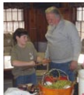
Successful seminar yields great results.